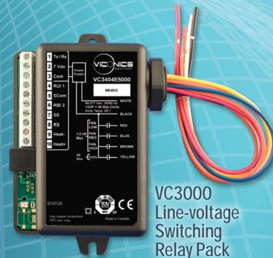
VC3000 Line-voltage Switching Relay Pack